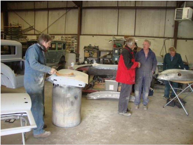
Overall view of projects underway at the Rumble Seat shop.

The Rumble Seat Shop is well equipped with the necessities of autobody repair and fabrication but certainly has the atmosphere of taking a step back in time with the vintage of some of the equipment. The facility is practical if not modern with some of the equipment having been fabricated by Don himself to serve a specific purpose with metal fabrication or repair. And the shelves on the walls are stacked with odd bits of project leftovers, supplies, spares and antique pieces from many years gone by. There was even the hollow body shell of a mid thirties Chevy perched up on top of a shelf unit.