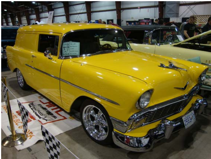
Ronnie's Tweety Bird shined up and lookin' good.

The Fifty 5-6-7 Club was well represented at this BC Custom Car Show with three fine entries on display. As you can see in the pictures below, we had a compact but well done display which drew a decent share of the car nuts who made their way out to the Tradex Center. Bigger and better next year!?! You bet!