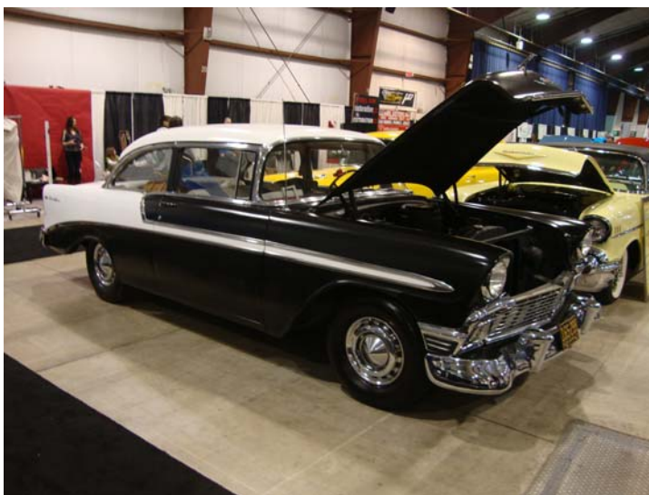
Pat's great lookin' 56 complete with celebrity autograph.